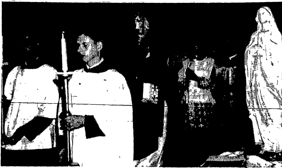
OPENING THE ACADEMIC year at St. John Fisher College His Excellency is shown in procession at Mass of the Holy Ghost celebrated at the men's college. The mitre worn by the Bishop and picturing St. John Fisher, the college's patron, is reserved at the college for ceremonies such as this.