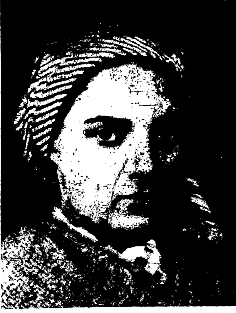
Portrait photo of a saint—St. Bernadette Soubirous as she looked in 1858, the year the Blessed Virgin Mary appeared to her at Lourdes in southern France. Today her incorrupt body rests in a convent chapel at Nevers in central France.

AFTER OUR VISIT to Lourdes, we returned to the city of Goodridge, Minn. At the Goodridge, Minn. church, a Mass was celebrated by a Belgian prelate at the same time for us to have Bernadette described the vision of our Lady. She stated at every one. At Lourdes you know. My sister, Sister from the 20th of Massabielle and her smile speaks leading and pardon for all God's children.