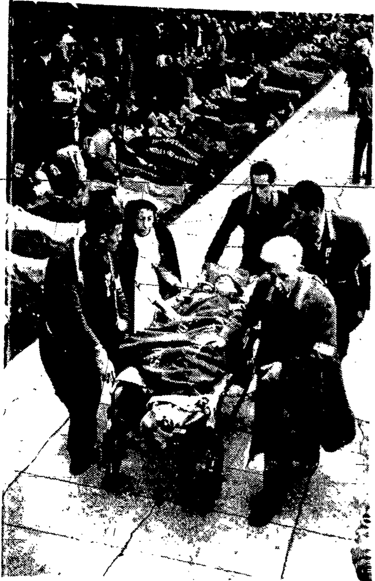
A critical case is rushed to medical center as stretcher pilgrim takes sick during open air service at Lourdes.