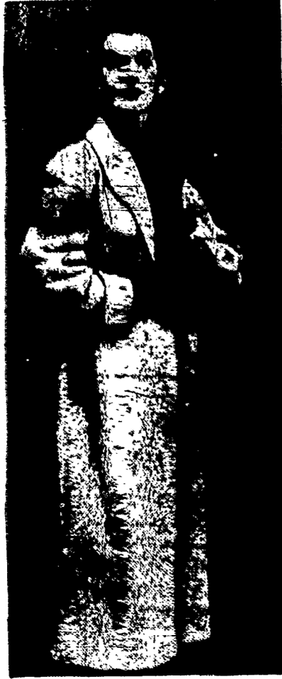
So feel as elegantly at ease as you look $69.95

So clean-cut, so right. you wear it everywhere... your versatile, classic coat of Shagmoor's exclusive 100% wool fleeces. A beautifully simple backdrop for a multitude of casual and dress-up accessories. SIZES—6 PETITE TO 44