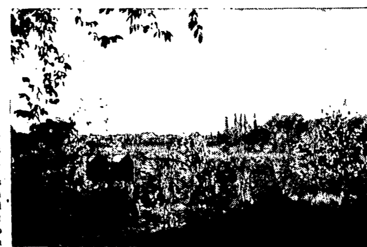
Site of new Our Lady of Mercy Church, 600 Denise Road, Greece. (Story on page 1). Caldwell & Cook's Lakewood tract is included in new parish boundaries.

away from it all room where complete relaxation can prevail. Let the youngsters play upstairs. I'd say, let them fool around with the HiFi and go lelekey split through the all-glass "Hotpoint" kitchen. The meticulous bedrooms, orderly dining room and spacious living room. If it were me... I'd go underground. Who's dealing?