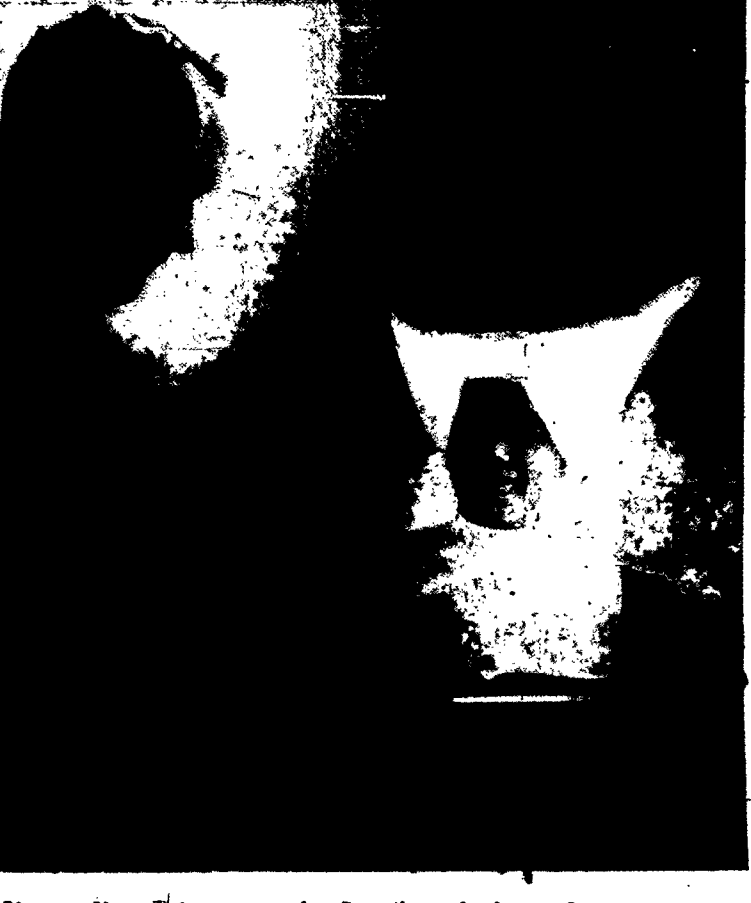
Sister Simplicia records details of doctor's report on midnight emergency case.