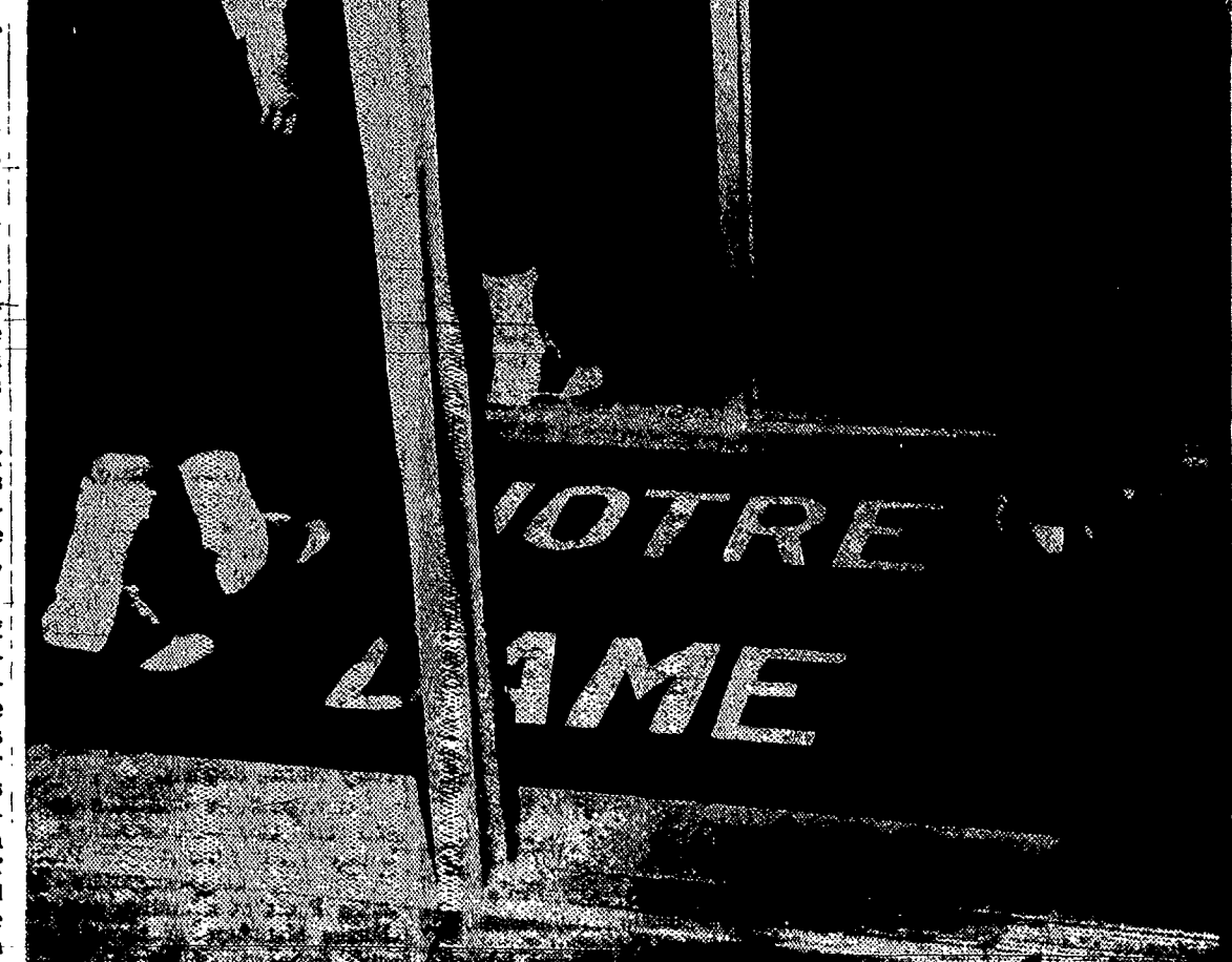
September will find 510 Pairs Entering