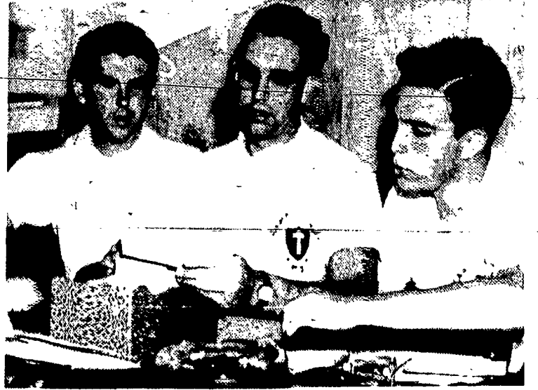
STAFF CHECKS CAMP SCHEDULE

He heads the Aquinas Student Council, is president of the senior class and is a member of the football, basketball and track teams.