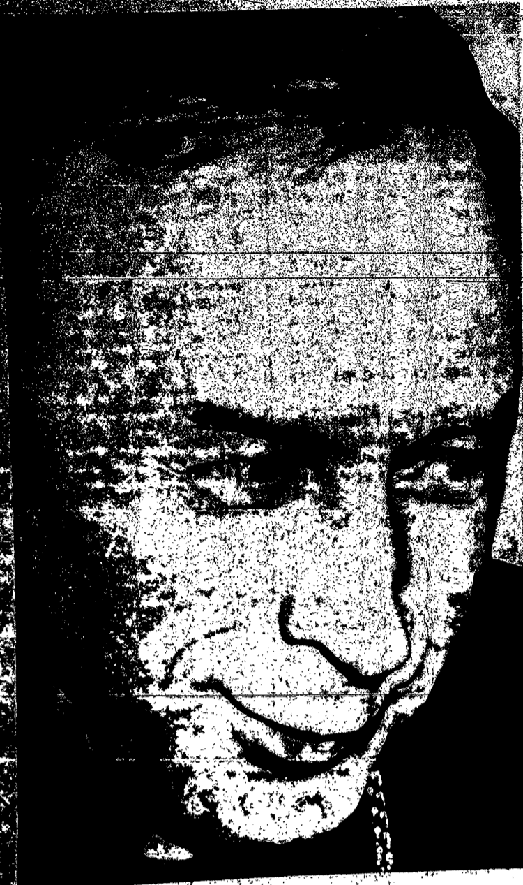
CARDINAL WYSZYŃSKI Target Date—1966