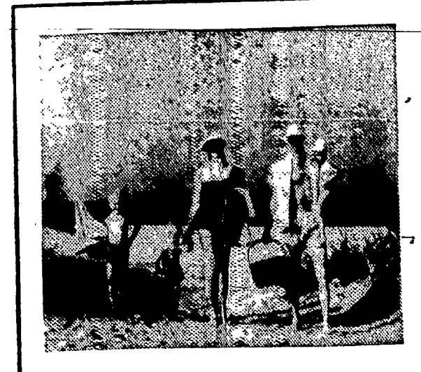
Get in the Swim of Vacation Fun