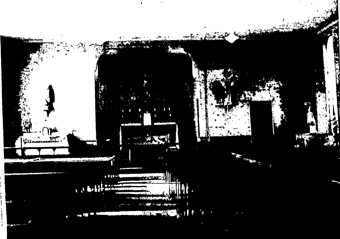
Interior of Macedon's century-old St. Patrick's Church.