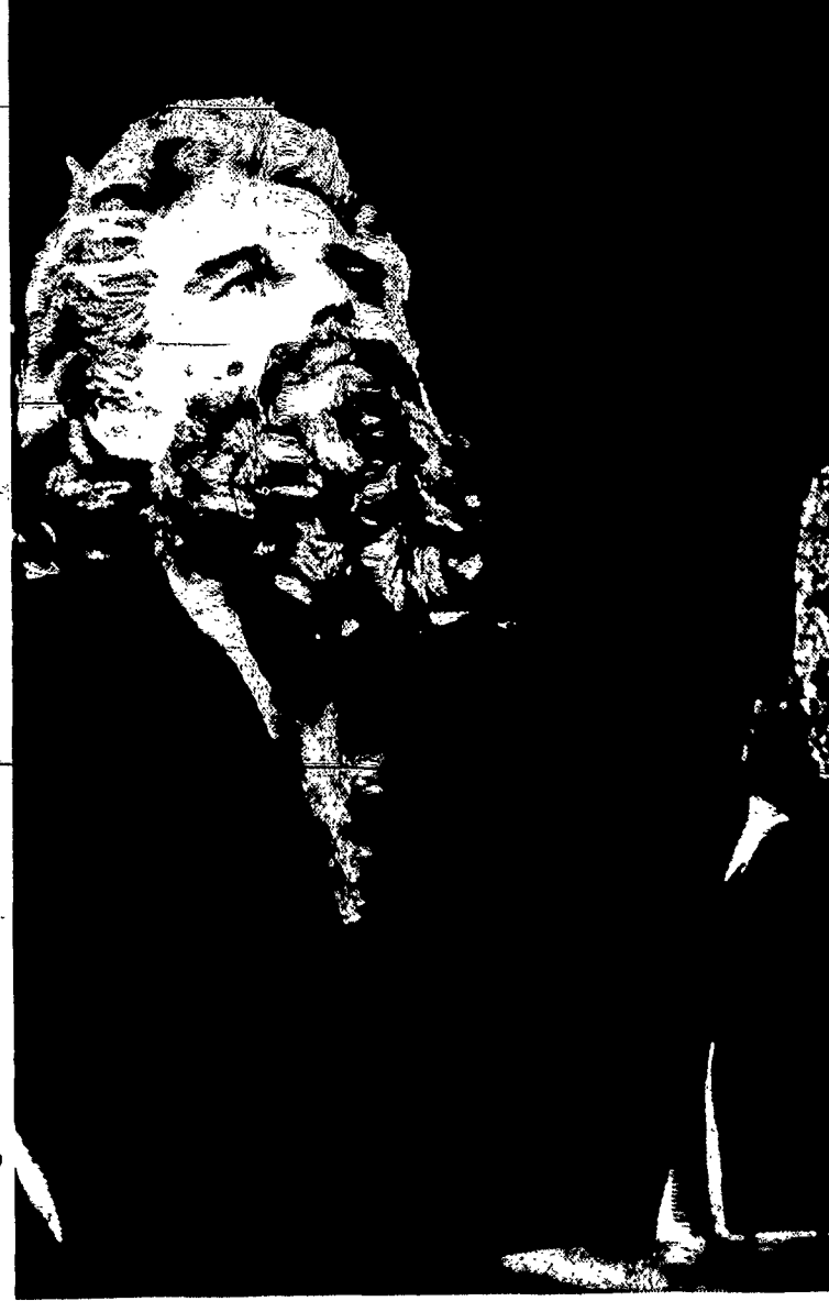
Ten Commandments given by God to Moses at Mt. Sinai over 3,000 years ago are laws of love for all God's human creatures. Photo is from current movie. Article tells why of keeping commandments.

AT FIRST sight it may seem strange to place the words "love" and "law" side by side. It is a very popular impression that law represents something forbidding, restricting, joy-killing and severe; while love represents that which is appealing, carefree, pleasant and sweet.