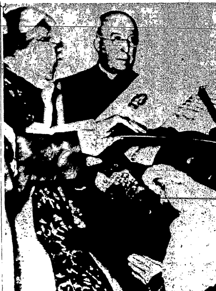
A solemn moment for Cardinal Wyszyński, Primate of Poland, shows him receiving the red hat and ring of a Prince of the Church from Pope Pius XII in Vatican City. Raised to the cardinalate in 1953, the Cardinal did not attend rites in which 22 colleagues were invested, for fear the Communist Polish regime would not let him return.