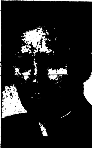
Father Mulcahy Family Center Director

Applicants are also asked what kind of a child they prefer. Caseworkers will also explain what children are at that time available for adoption. Insofar as possible, children are placed with couples they can be expected to resemble. This, explained the agency, assures a more normal family life as