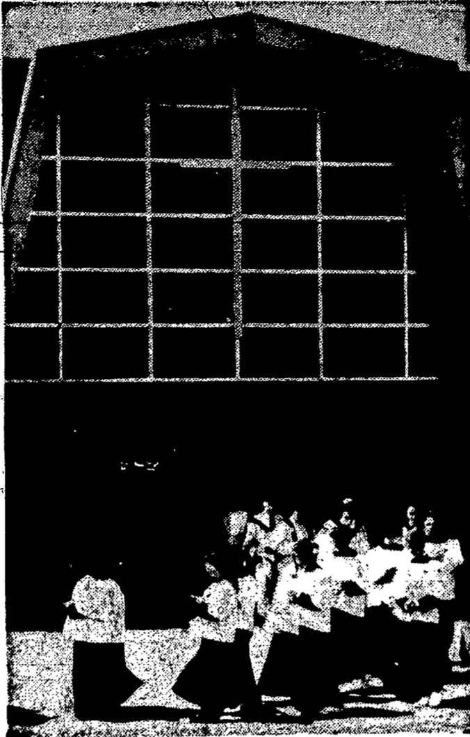
Easter Rites Open Church