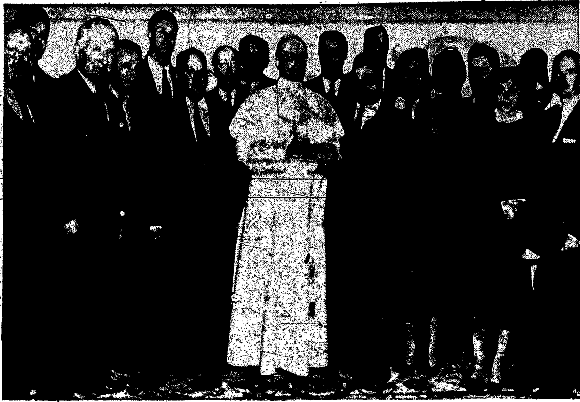
Meeting with 21 American newspapermen in Vatican City, Pope Pius XII urged that they remain steadfast to the ethical principles worthy of a noble art. He stated that "One may well shudder at the flood of error and false standards let loose by the communication arts today." He prayed God to help newspapermen give their readers nothing but the truth, "as far as your serious research can ascertain it."