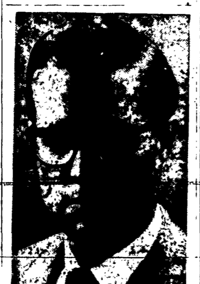
"I was worried about getting a personal loan"