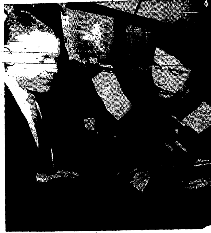
Sodality 'Day With Mary'