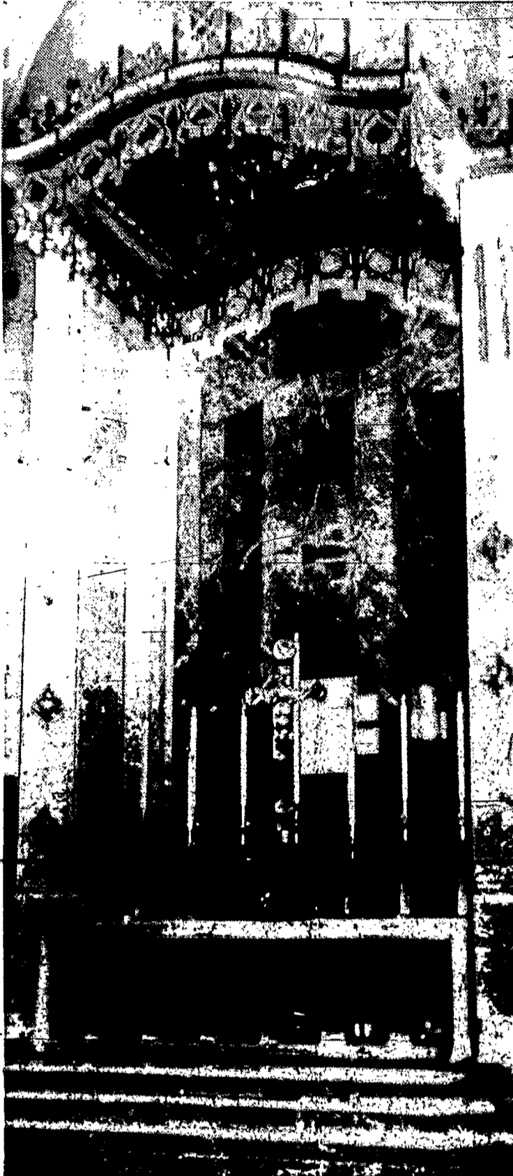
Cathedral's New Altar stands in marble majesty in Sacred Heart sanctuary awaiting solemn consecration rites to be conducted Tuesday, March 12, dedicating the 65-ton structure for divine worship. Red marble table is capped by bronze canopy supported on white marble pillars.

At the foot of the altar's front section are bronze repousse symbols of the seven sacraments.