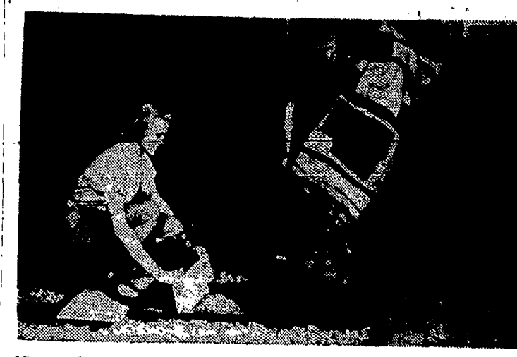
Man-and-wife team pour mineral wool insulation into attic froor.

Even if you're a home-owner depth and smooth it with a piece who's all thumbs with tools, here of board. is one way you can get your. The wool should be leveled out one of the rare jobs around the lation thickness is what counts, of pieces of board.