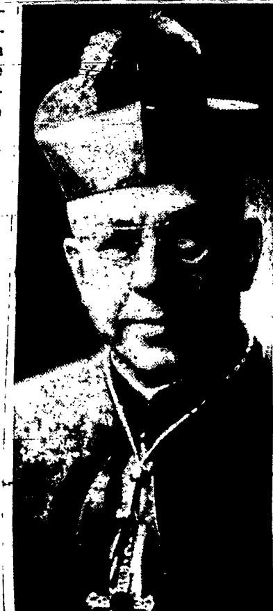
BISHOP KELLENBERG 'enlightened laity'

"On the negative side, we can urge you simply to scorn not. Do not look with disdain