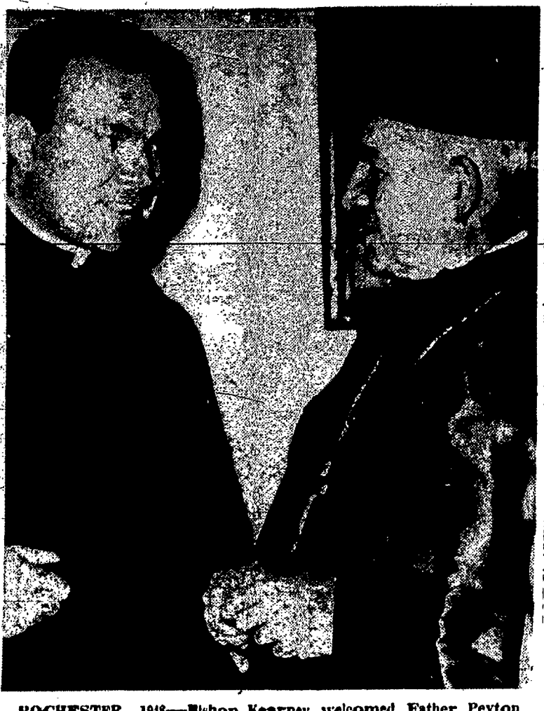
ROCHESTER - 1948 - Bishop Kearney welcomed Father Peyton to the city when the famed "Family Rosary" priest addressed a Columbus Civic Center Rally.