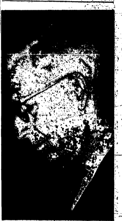
SENATOR DOUGLAS No Sympathy

Washington—(NC)—Marshal Tito, communist dictator of Yugoslavia, has been invited to pay an official visit to the United States and has accepted. Only the details connected with the visit remain to be worked out. Such details include when Tito would come here and what cities he would visit during his stay in this country. There has been no official announcement of any of these facts, but they are accepted in authoritative circles here. The invitation apparently was extended several weeks ago through the United States embassy in Belgrade. Tito accepted at once. When Secretary of State John Foster Dulles said in December that "sympathetic consideration" was being given to a proposal to invite Tito to this country, his announcement touched off vigorous and widespread criticism. The invitation apparently was extended several weeks ago through the United States embassy in Belgrade. Tito accepted at once. When Secretary of State John Foster Dulles said in December that "sympathetic consideration" was being given to a proposal to invite Tito to this country, his announcement touched off vigorous and widespread criticism.