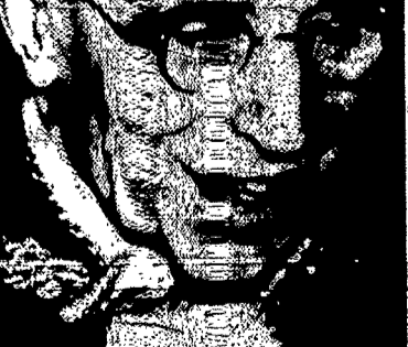
POPE PIUS XII Peter's Throne

London—(NC)—A high Church group which promotes the Church Unity Octave within the Church of England has called for the restoration of Christian unity "about the Throne of St. Peter and his successors."