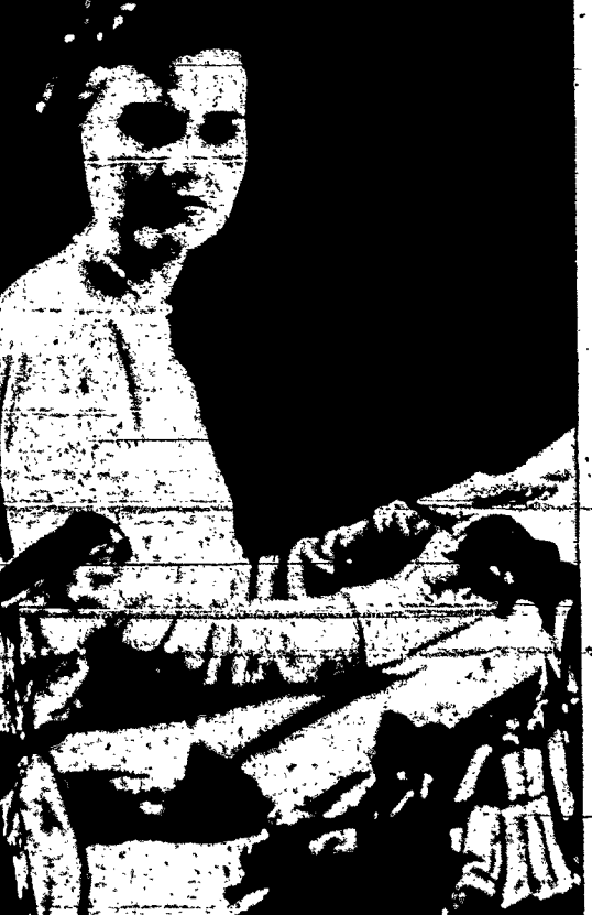
STAFF ARTIST for the Hallmark Company, publisher of greeting cards, is shown making sketches for a Christmas card. A group of antique státuettes are used as models

In the past few years a move- with tasteful and attractive origment has taken hold to restore insis and reproductions of masthe original meaning of Christ-terpleces to further this "Keepmas by exchanging cards that ing Christ in Christmas" revival.