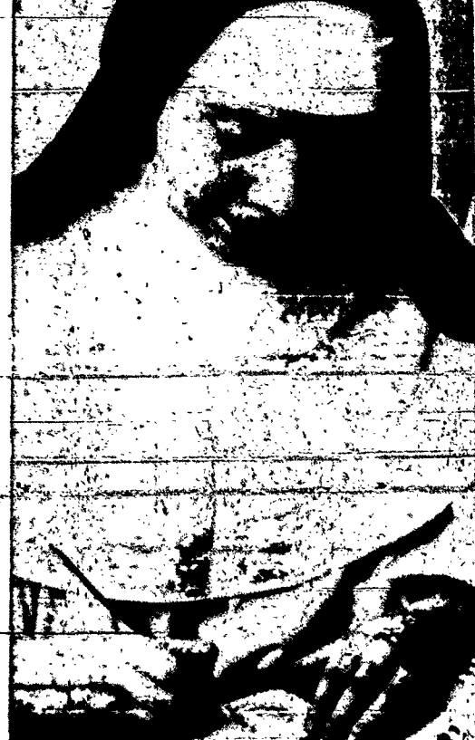
CLOISTERED NUN of the Trappistine Order is shown above working on Christmas cards in the art shop of Mt. St. Mary's Abbey, Wrenth-