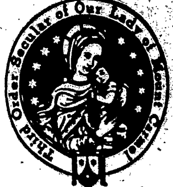
Third Order of Our Lady of Mount Carmel will meet Sunday, Nov. 11, 3 p. m. at Our Lady of Victory Church, 10 Pleasant St. Profession Ceremonies will be part of the monthly meeting. An invitation is extended to those who would like to attend, whether a Tertiary or not.