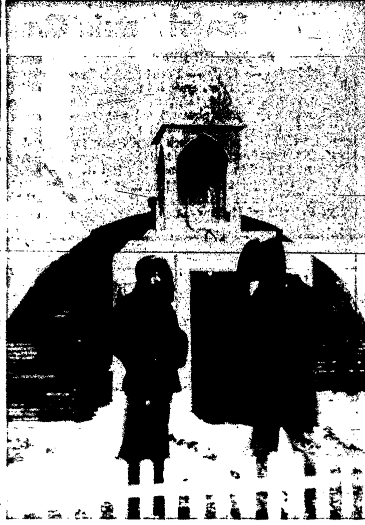
Chapel in Antarctic