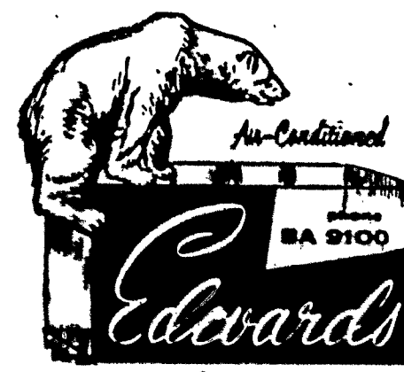
EDWARDS—Daytime Dresser, Third Floor

The girl in Edwards brushed rayon jumper is more than a jump ahead in fashion. For late and Indian summer days and dates, wear as is. For school work, wherever, team it with a jersey, sweater, or blouse. Don't worry about upkeep either — it's thrifflily washable. Black, luggage, red, blue, or turquoise. Sizes 12 to 20, 14 1/2-24 1/2.