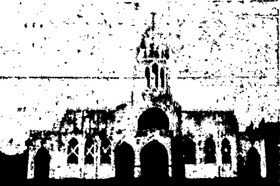
CHURCH IN ECUADOR built with the assistance of $1,000 bequest of a Rochester woman.