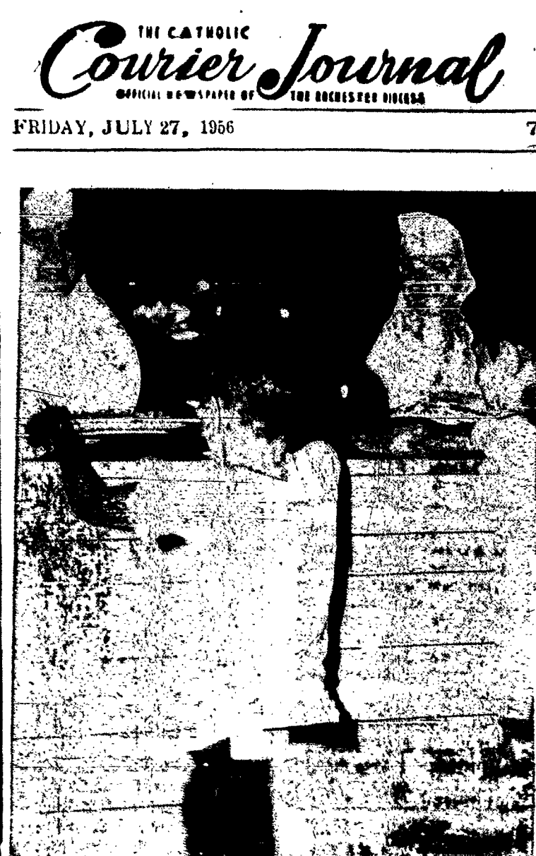
Camp Life —Sports, craft work, swimming and camps have been prominent at Camp Stella Maris, diocesan youth camp on Conesus Lake during the past few weeks.