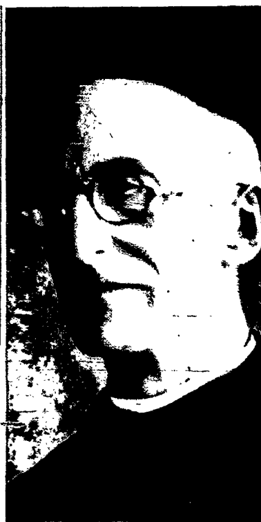
FATHER JANSENS Jesuit General in Rome