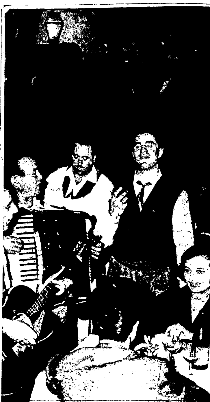
"Take your wife out for dinner," Monsignor DeBlanc tells husbands. Dining out occasionally gives a wife a chance to enjoy relief from household duties. Shown above is famous Rome restaurant called the "Cisterna" noted for its ham and egg recipe. No need to go all the way to Rome however. There are fine restaurants for you to treat your wife right near home, the author says in the article below.