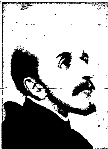
ST. IGNATIUS LOYOLA converted by a cannon ball

HIS JESUITS today are everywhere and strategically placed. There is a Jesuit college at Oxford, and in Washington they teach diplomats the intricacies of government. In Rome they staff the Gregorian University, the Biblical Institute, and a special Russian College. There are