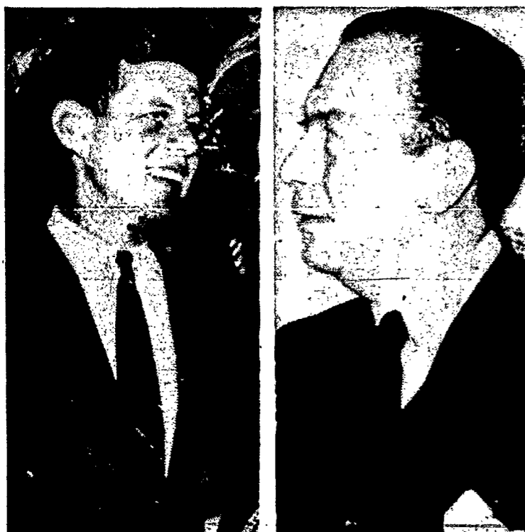
Mayor Robert F. Wagner of New York (right) and U.S. Senator John F. Kennedy of Massachusetts (left) are "prominently mentioned" for the democratic vice-presidential nomination.