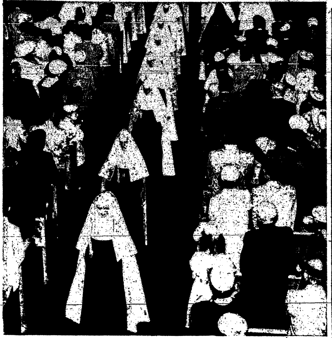
NEW MERCY SISTER'S RECEIVED—Ceremonies held Sunday at the Sisters' of Mercy Motherhouse in Rochester saw 24 young women receive the religious habit of the Mercy Community. Shown here in photo, the novices, wearing the black habit, white choir cloak and white veil, file in procession from the Motherhouse Chapel following the reception rites which were attended