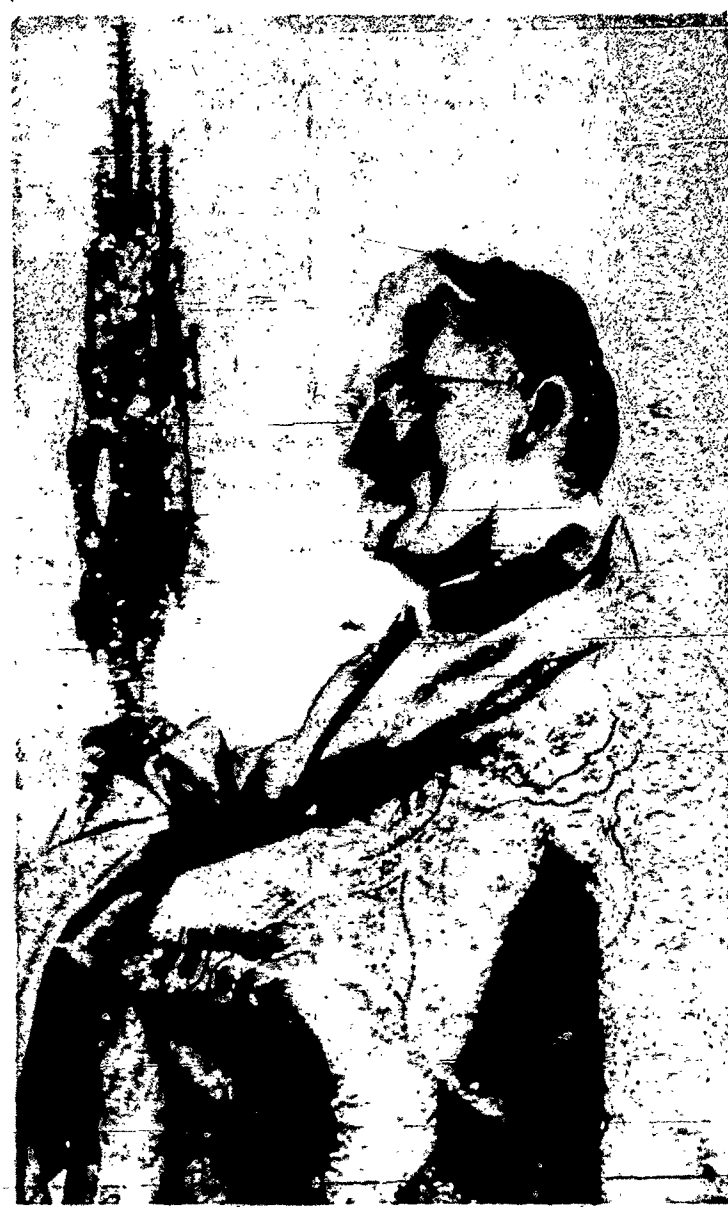
Feast of Corpus Christi, Thursday, May 31, calls Catholics to honor Christ in the Blessed Sacrament.