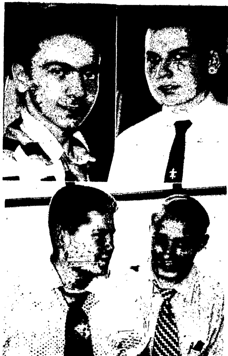
Winners At Science Fair