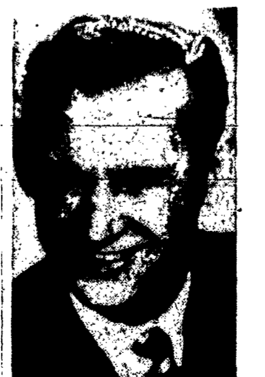
SAMMY KAYE Sammy Kaye and his popular "Swing and Sway Orchestra" will headline the 18th annual Police Ball when it takes over the new Rochester War Memorial on the evening of Tuesday, May 29.