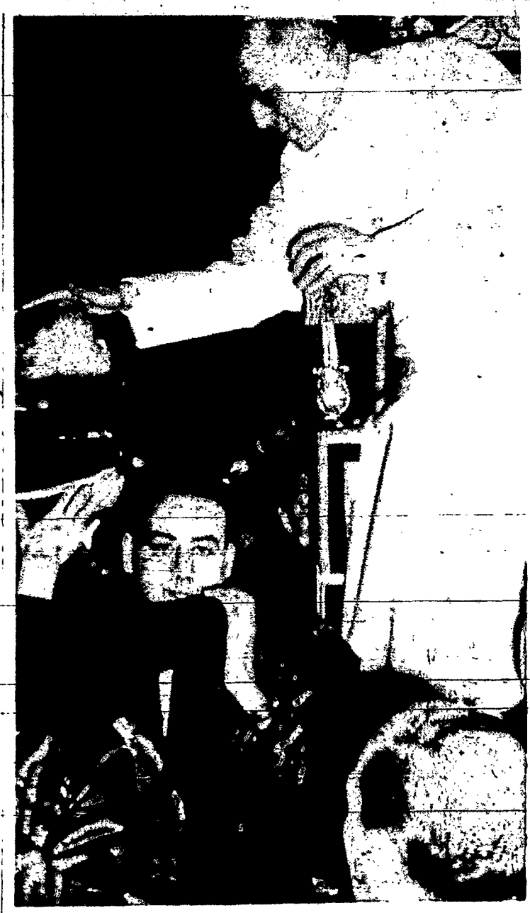
Anyone Know This Tot's Name?

Marian Devotion Based On Christ See Page 4