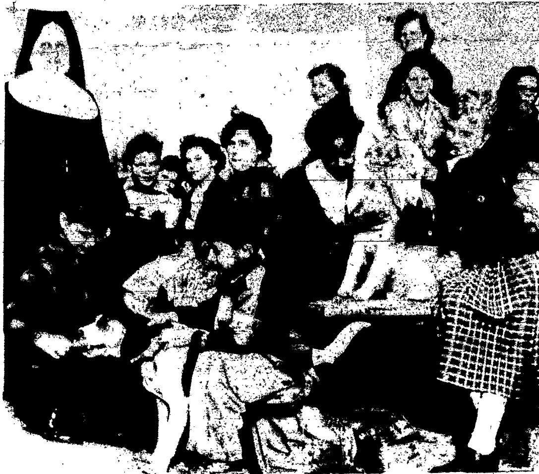
Sisters keep watchful eye on Villa's 145 children

SISTERS OF ST. JOSEPH and other members of the Villa