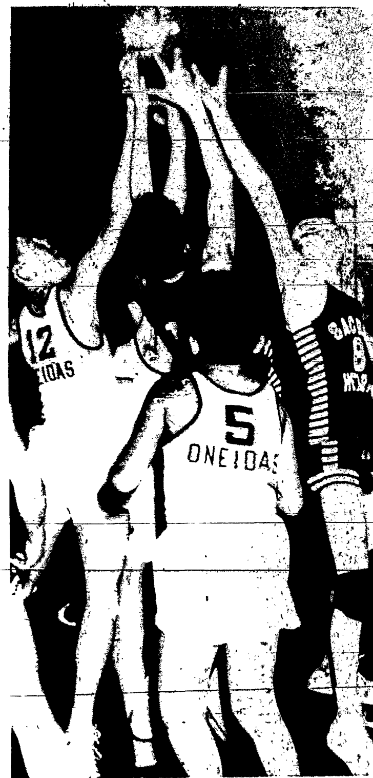
Last minutes of C.Y.O. basketball game

Nazareth Hall Cadet School has been active in the physical education program including the forthcoming Gymnastics to be presented May 7 and 8 at the C.Y.O. McQuaid Jesuit High School and Aquinas Institute swimming groups and swimming teams have been un-