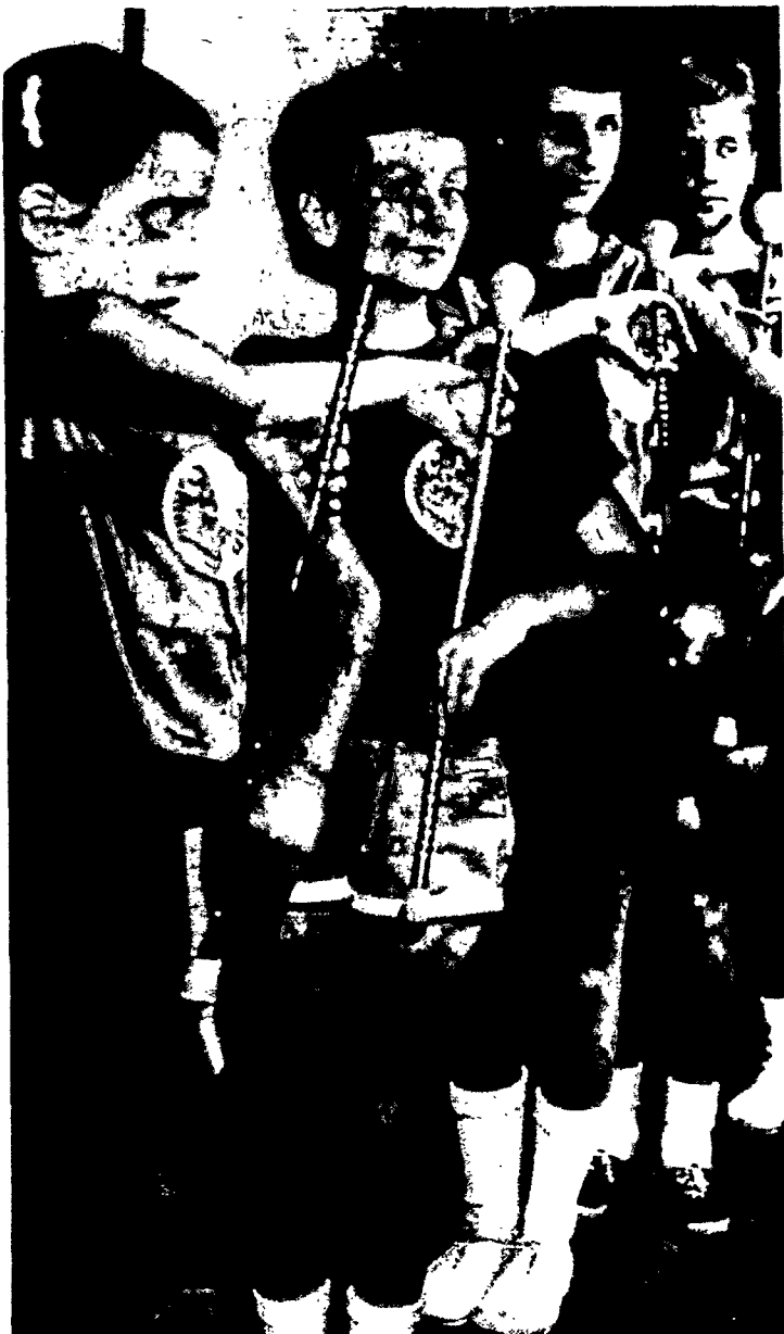
'Strike Up The Band'