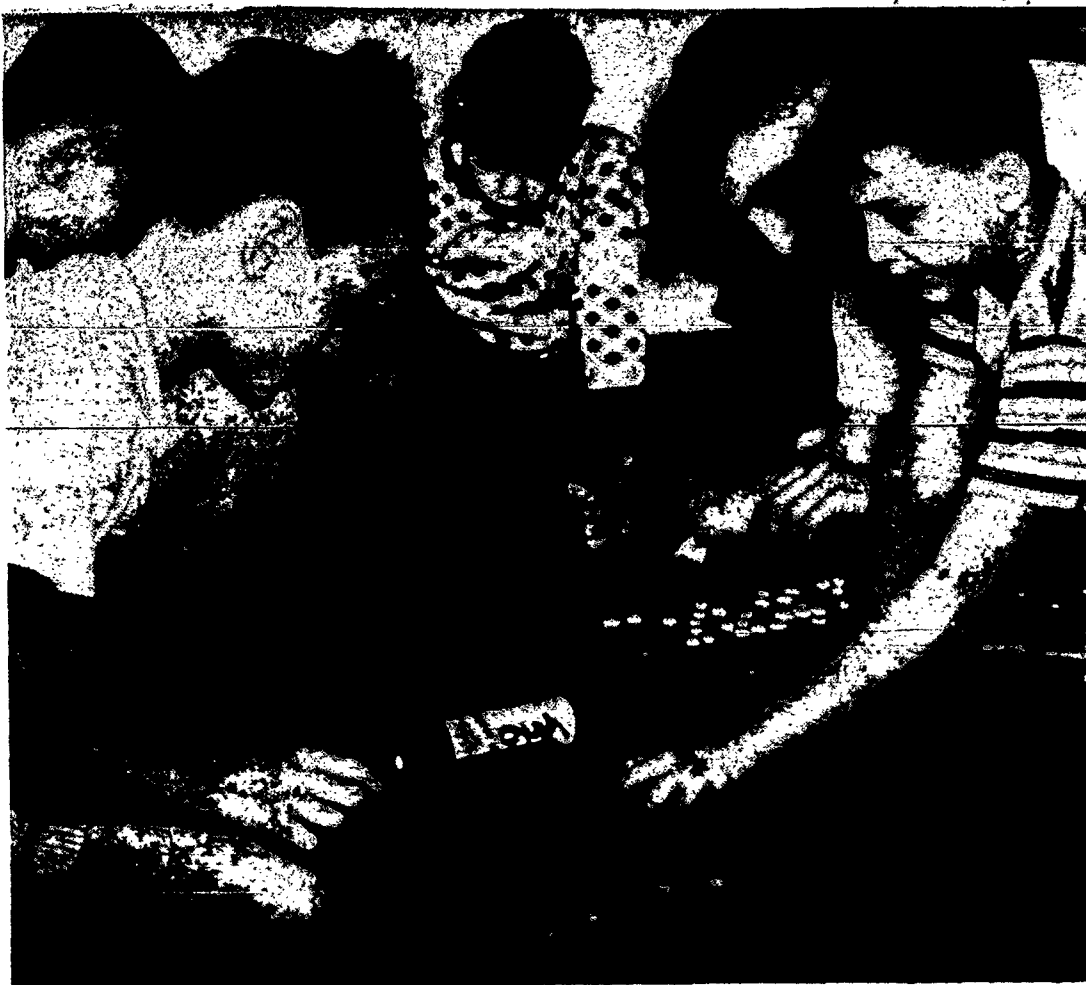
After school fun and games at Settlement Houses