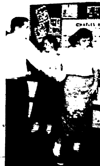
Swing Your Partner