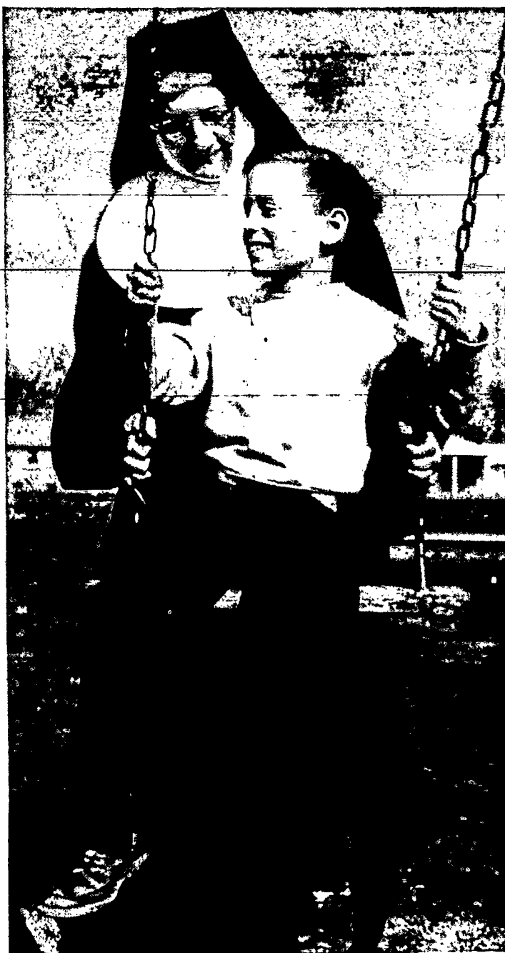
'Swing me high, Sister'

A former director of the agency in reminiscing recalled that many former foster children in the Agency's program are today priests, sisters, doctors, nurses, lawyers, teachers and people serving their homes and communities. Some foster home, he said, had much to do with this achievement.