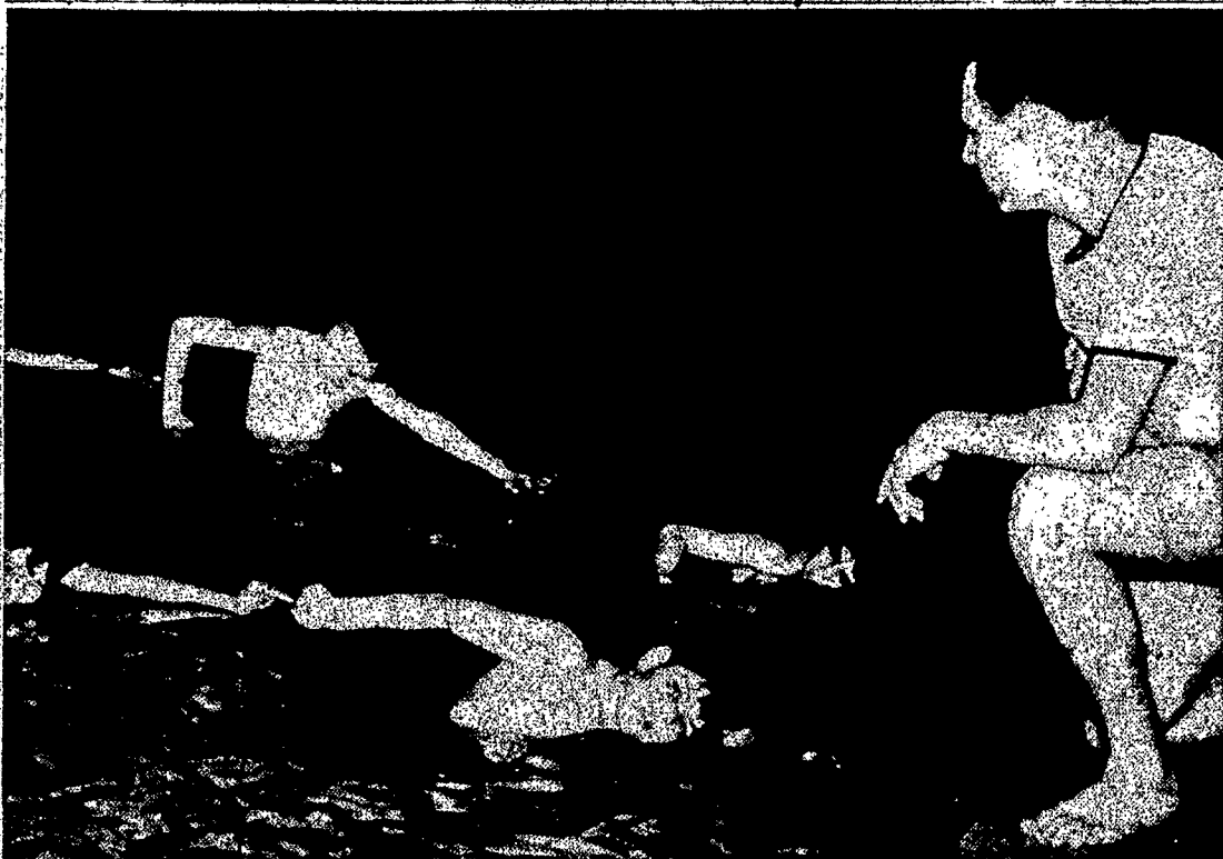
CYO Swim Lesson at Columbus Building