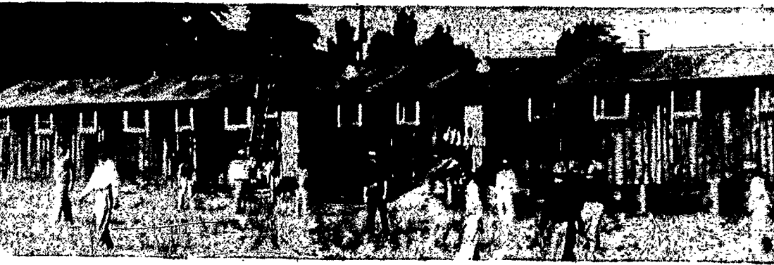
MIGRANT WORKERS and families pour into U. S. to aid in seasonal job demands. Housing, wages often are sub-standard. Texas