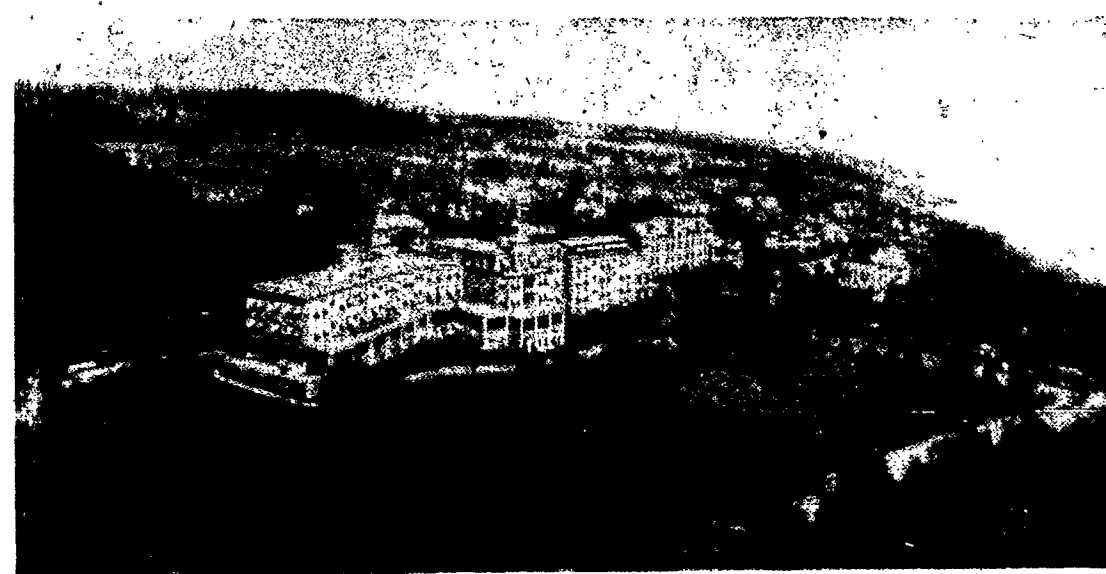
A Catholic point of interest in this tourist town is St. Anthony of Padua Minor Seminary and Preparatory School.