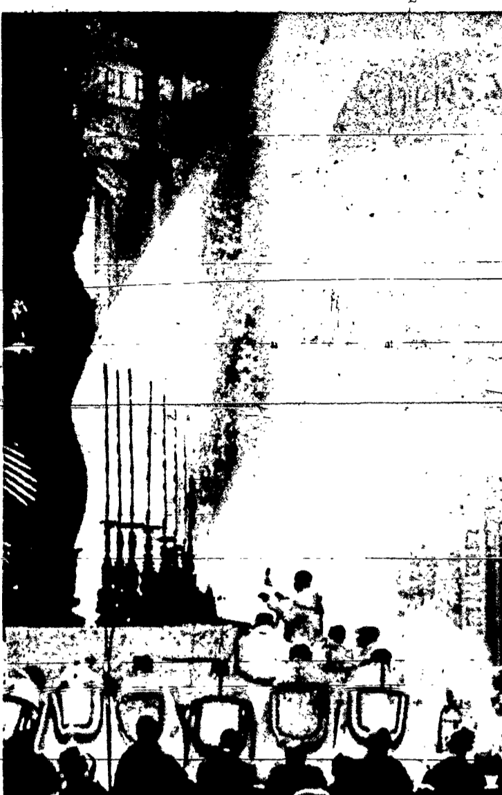
POPE PIUS XII celebrates Mass at Vatican altar over tomb of St. Peter. St. Peter, martyred in Rome, was buried on the Vatican hill where Christians later built a chapel, ultimately the present vast basilica which dates from the 16th century.

must go to school, and that schools must be provided for them. How can it be argued that a child is receiving the equal protection of the laws, if he is denied equal educational opportunity because his skin happens to be one color rather than another?