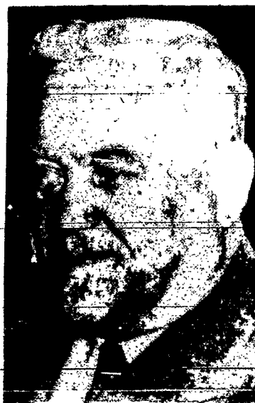
PREMIER BULGANIN Red Visitor

Bishop John Heenan of Leeds, an authority on Communism, declared more outspokenly in the Catholic weekly The Universe: "Complete lack of principle is of the nature of Communism. Expediency is the law of life. Let the enemies of God be told that we trust not their words but their deeds."