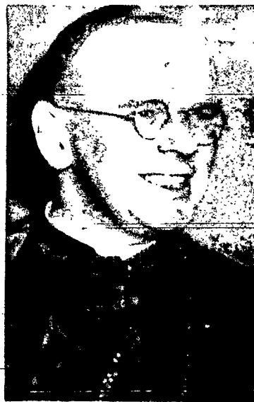
CARDINAL GRIFFIN "Watching Behavior"

All Britain's Catholic newspapers featured the advice of Cardinal Griffin, Archbishop of Westminster, to the Eden government that the 28 million Catholics in the British Commonwealth are watching its behavior carefully during the Russian visit, and that the Russian leaders, under the declared inspiration of Khrushchev, are patently propagating the compatibility of Communism and Christianity.