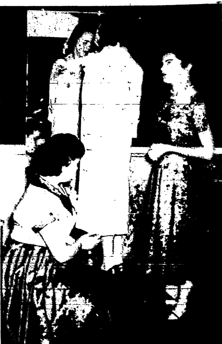
SCHOOL OFFERS VARIED COURSES—Vocational and home-making courses are highlighted at the School of the Holy Childhood, which provides specialized training for exceptional children. Photo above pictures the course in dressmaking. Funds for the school's operating costs will be sought next week from friends of the institution.

THE CATHOLIC Courier Journal OFFICIAL PAPER OF THE ROCHESTER DIOCESE FRIDAY, APRIL 13, 1956