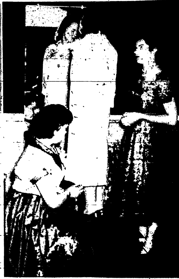
SCHOOL OFFERS VARIED COURSES —Vocational and home-making courses are highlighted at the School of the Holy Childhood which provides specialized training for exceptional children. Photo above pictures the course in dressmaking. Funds for the school's operating costs will be sought next week from friends of the institution.

THE CATHOLIC Courier Journal OFFICIAL NEWSPAPER OF THE ROCHESTER DIOCESE FRIDAY, APRIL 13, 1956