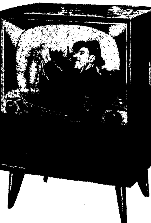
General Electric 21" Console model, regularly 249. Sale priced at 189.00

This is a unique opportunity to own a fine 21" or 24" G.E. television . . . to enjoy the coming events of the summer . . . baseball, political conventions, fights, Kentucky Derby.