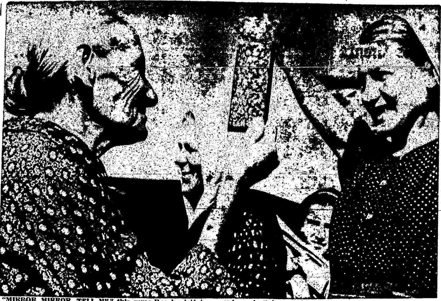
"MIRROR, MIRROR, TELL ME," this young Russian bride-to-be says, "am I pretty in my ill-made, homely clothes?" Women in Communist-dominated homeland and satellite countries are still noted for their poor quality.