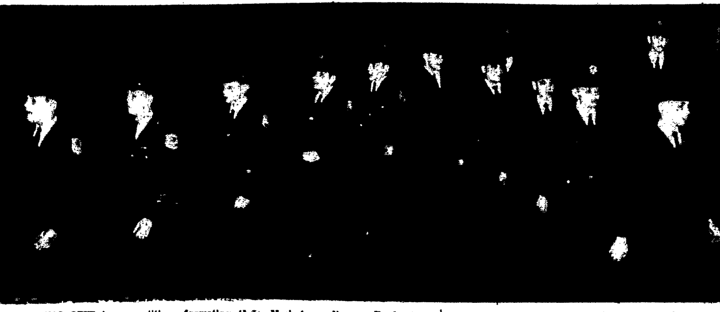
STEPPING OUT in competition formation this Musketeer division won most points at annual spring inspection of Nazareth Hall battalion of cadets on March 22 at the Cadet School in