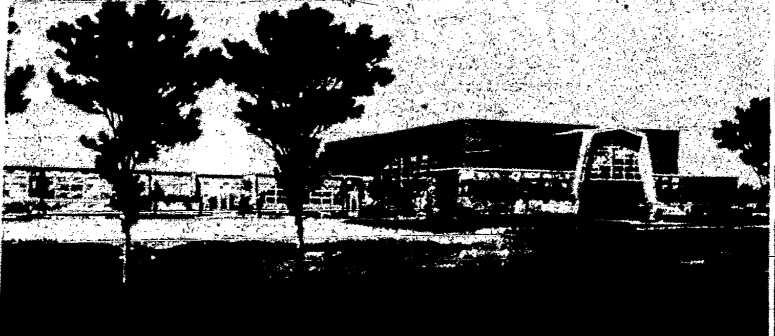
PROPOSED CHURCH AND SCHOOL — Architect's drawing of the proposed Christ The King Church and School buildings. Groundwork, for which ground will be broken at 3 p.m. Sunday, March 18, pictures the church (at right), to seat 320 persons, and the school in the wing at left. A parish hall will adjoin the church at extreme right. A campaign for building funds will be conducted among parishioners of the newly-established parish on Sunday afternoon, March 25.