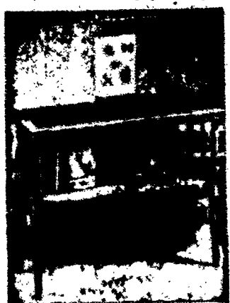
This small table can serve many purposes. Only 23 inches high, it is ideal as an end table. The styling is Italian Provincial with a modern black top.

The benefits of advertising is basically concerned with circulation. Volume circulation (Continued on Page 8-A)