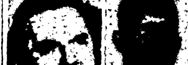
Archbishop Joseph F. Rummel