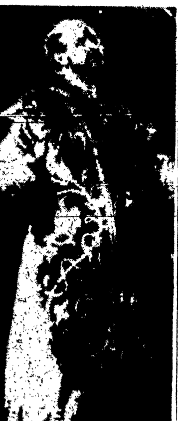
ST. IGNATIUS LOYOLA

DURING THE 400 years of its existence, the Society of Jesus has produced 23 canonized saints. Among these canonized are: Ignatius Loyola, founder of the Order; Francis Xavier, "The Mis-