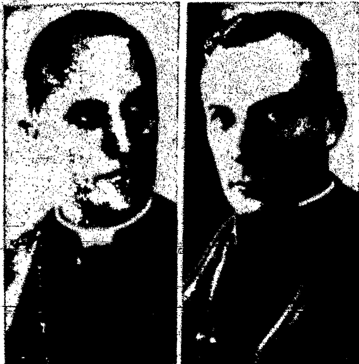
Alojz Cardinal Stepinac, Archbishop of Zagreb, Yugoslavia (left), and Stefan Cardinal Wyszyński, Polish Primate (right) are two of many Catholic prelates held under arrest by Reds in Iron Curtain countries.